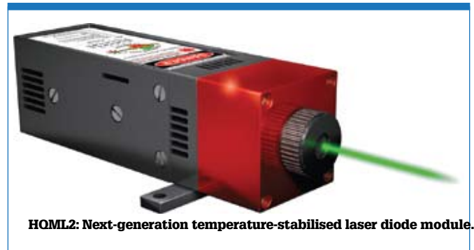
HOML2: Next-generation temperature-stabilised laser diode module.

It comes in a hermetically sealed, uncooled two-pin package, which measures 26mm x 12.7mm x 7mm.